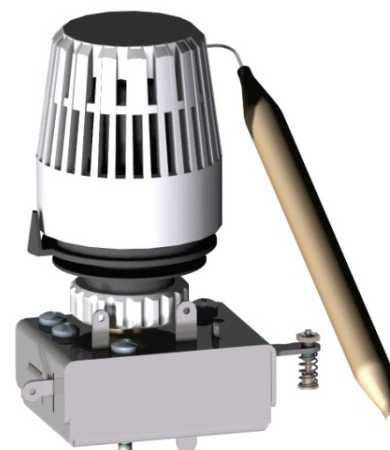
ZW 4 Aquastat

To release the safety catch, the safety lever is pulled into the upper position and locked into place. It must be borne in mind that the remote sensor must be cooler than the set limit temperature.