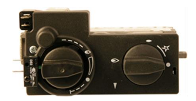
SIT 630 gas valve