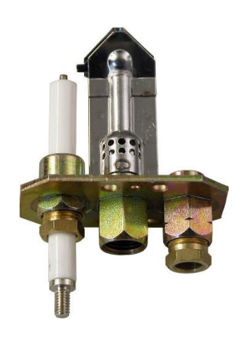
Jet Set Nat Gas Maxitrol