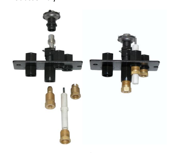
Jet Set Nat Gas SIT (note red paint on bypass screw)