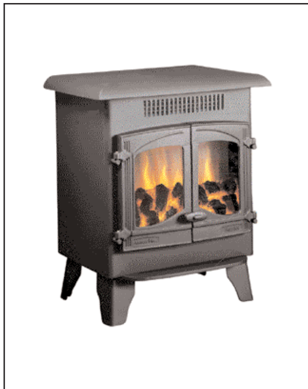
Hamlet Electric Stove

PLEASE RETAIN THESE INSTRUCTIONS FOR FUTURE REFERENCE