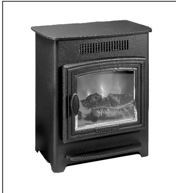
Becton Electric Stove

PLEASE RETAIN THESE INSTRUCTIONS FOR FUTURE REFERENCE