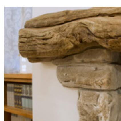
Shown with our outstanding 60" wide (1524mm) Fowey beam

So, so realistic, our reproduction stone chamber and stone facia ooze the charm of the original natural stone blocks the design originated giving your fireplace a natural and impressive look with the character and workmanship of true craftsmen. Creates an absolutely visual delight when used in conjunction with one of our beams. Designed to allow installation into most chimneys without the dimensional constraints of solid stone blocks. Will take centre stage to every room that this masterpiece adorns.