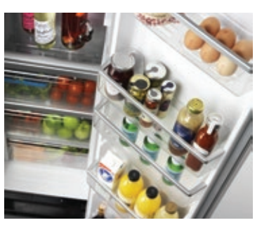
Super cool mode captures the freshness of your groceries by chilling the entire fridge quicker.