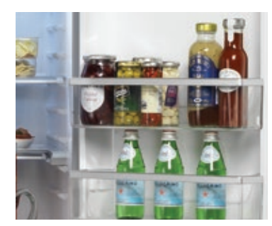
The interior is finished with stylish silver shelf edges.