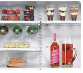
Adjustable, Spill-proof glass shelving enables the shelving configuration to be altered using the half-width and full width shelves in higher and lower positions.