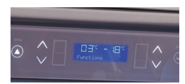
The treated anti-bacterial stainless steel interior and drawers captures cooler temperatures to reduce the effect of temperature changes.