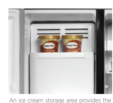
perfect ready-to-eat temperature.