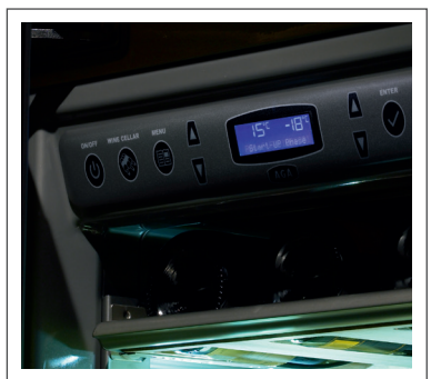
Lights illuminate the interior and turn off automatically to prevent damaging the flavour of the wine. A humidity control panel recommends accurate temperatures for your wine, but is easy to adjust depending on your preference.

A unique Riserva<sup>™</sup> zone is designed specifically for storing gourmet and vintage bottles for longer periods. The shelves are made from beech wood, which doesn't impregnate the wine with conflicting flavours and smells.