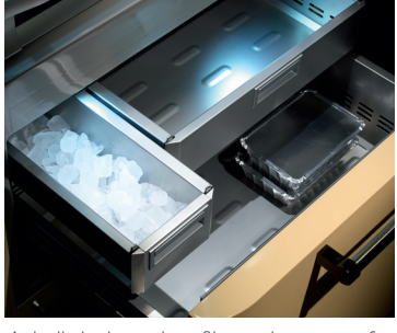
A built-in icemaker filters the water for greater purity, ensuring odourless and untainted custom-sized ice. The built-in water filter features a sensor that lets you know when to change it based on the amount of ice consumed.