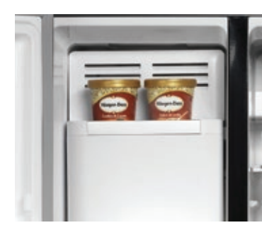
An ice cream storage area provides the perfect ready-to-eat temperature.