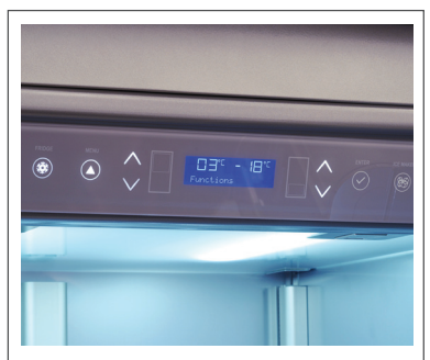
Each section has its own separate evaporator with electronic temperature control so you can optimise the settings to suit the type of food being stored.

An easy to use interactive digital menu – which shows the actual temperature of each compartment – lets you tailor your refrigerator to your way of living. The energy saving setting puts the refrigerator into a holiday mode or in shopping mode to maintain the temperature of food already in the refrigerator and also to target the temperature of the food that has just been purchased at the supermarket to get it back to the correct temperature as quickly as possible. There is even a bottle cooler function that will ensure you never freeze a bottle of wine. The Premium Refrigerator has an A+ energy efficiency rating.