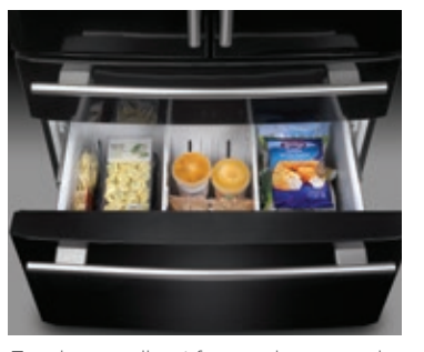
Two, large, pull-out freezer drawers make it easy to access each item. The freezer drawers feature five interchangeable compartments providing a net capacity of flexible 121 litres of storage.