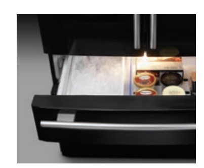
The automatic ice maker is electronically controlled to produce the ice cubes quickly and can be deactivated to provide additional freezer space.