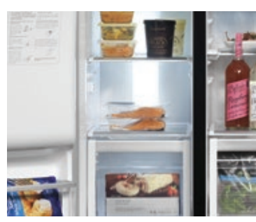
The freezer features contemporary fulllength LED lighting, whilst a Super freeze mode preserves the nutritional value of your food by freezing in the shortest time possible.