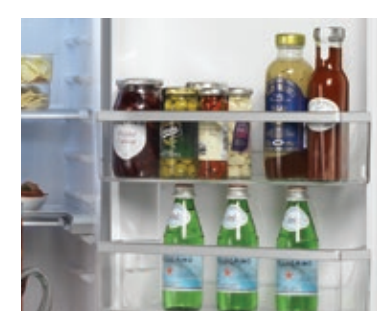
The interior is finished with stylish silver shelf edges.