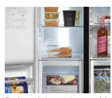
The freezer features contemporary full-length LED lighting, whilst a Super freeze mode preserves the nutritional value of your food by freezing in the shortest time possible.