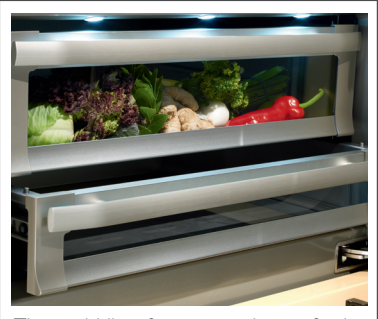
The middle fresco section of the refrigerator, like all zones, has its own evaporator & temperature controller but on this section, the humidity is also maintained at a high level. This helps to retain fresh fruit, vegetables, meat or fish in perfect condition for longer than a conventional refrigerator.