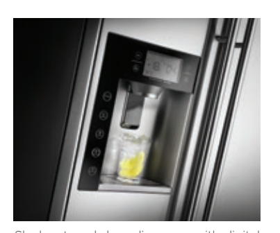
temperature control and electronically controlled filtered water and ice dispenser, providing a choice of cubed or crushed ice.

Note: *Cream side exterior panels **Black side exterior panels