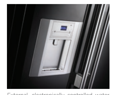
External, electronically controlled water dispenser providing fresh, chilled filtered water. It has a child lock functions and easy-to-change filter.

Note: *Cream side exterior panels **Black side exterior panels