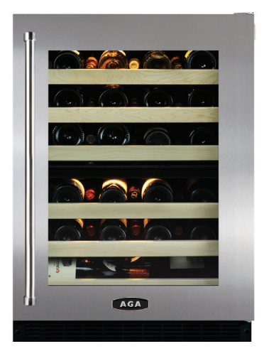
44-bottle Dual Zone