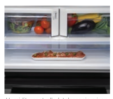
Humidity controlled, telescopic crisper drawers help to extend the shelf life of fresh fruit and vegetables.