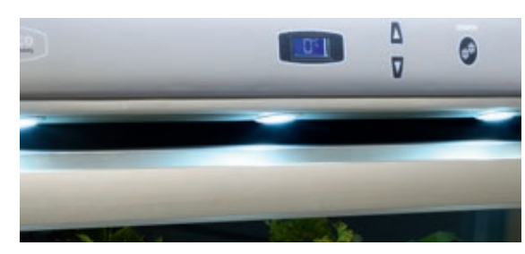
The TriMode™ option in the bottom drawer means that it can serve as a fridge, freezer or fresco, providing optimum temperature and humidity. Easily adjustable electronic controls let you decide at what temperature the TriMode™ drawer operates: • Freezer: as low as -22°C • Fresco: -2 to +2°C • Fridge: +2 to +8°C