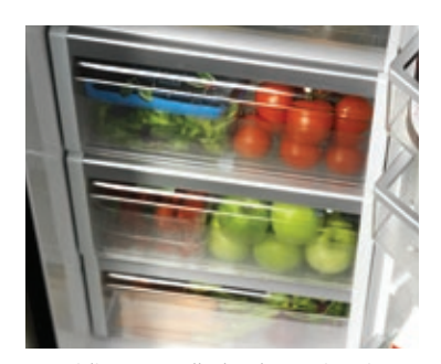
Humidity controlled, telescopic crisper drawers help to extend the shelf life of fresh fruit and vegetables.