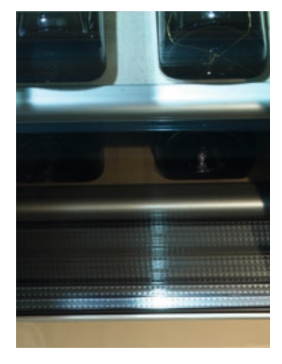
The triple-glazed, tempered glass door is tinted to stop UV rays harming the flavour of your wine and lets you see exactly what's on offer. As you needn't hide great taste, optional stands can be used to raise selected bottles for display purposes or a practical way to store an opened bottle.