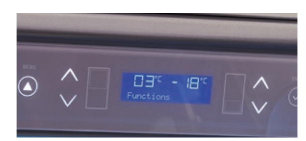
The treated anti-bacterial stainless steel interior and drawers captures cooler temperatures to reduce the effect of temperature changes.