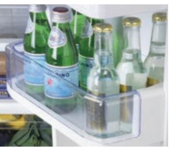
Extra door deep shelves accommodate the most popular, family- sized drink containers and are fully adjustable to cater for different heights and for ease of cleaning.