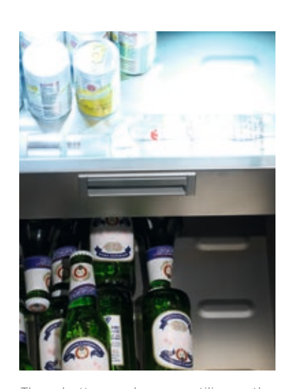
The bottom drawer utilises the TriMode^{TM} system, functioning as a Fridge, Fresco or Freezer, with temperatures as low as -22°C. Choose a setting to suit the occasion, whether storing lightly frosted vodka or chilled Belgian beers.