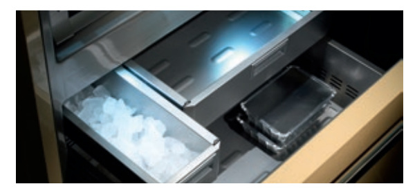
A built-in icemaker filters the water for greater purity, ensuring odourless and untainted custom-sized ice. The built-in water filter features a sensor that lets you know when to change it based on the amount of ice consumed.