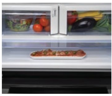
Humidity controlled, telescopic crisper drawers help to extend the shelf life of fresh fruit and vegetables.