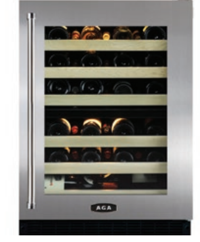
44-bottle Dual Zone