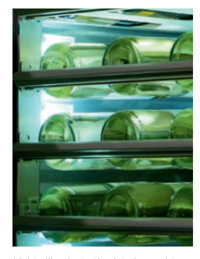
Lights illuminate the interior and turn off automatically to prevent damaging the flavour of the wine. A humidity control panel recommends accurate temperatures for your wine, but is easy to adjust depending on your preference.

A unique Riserva<sup>™</sup> zone is designed specifically for storing gourmet and vintage bottles for longer periods. The shelves are made from beech wood, which doesn't impregnate the wine with conflicting flavours and smells.