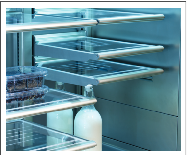
Split level ultra bright glass shelving enables you to adjust the position of each shelf individually to allow bottles to stand upright and maximize the storage space. The shelves are also easy to remove for cleaning.