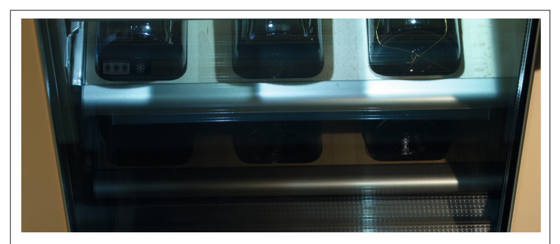
The triple-glazed, tempered glass door is tinted to stop UV rays harming the flavour of your wine and lets you see exactly what's on offer. As you needn't hide great taste, optional stands can be used to raise selected bottles for display purposes or a practical way to store an opened bottle.