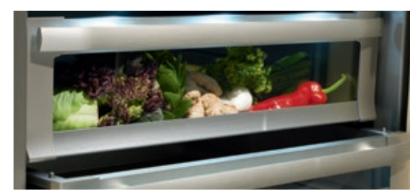
The middle fresco section of the refrigerator, like all zones, has its own evaporator & temperature controller but on this section. the humidity is also maintained at a high level. This helps to retain fresh fruit, vegetables, meat or fish in perfect condition for longer than a conventional refrigerator.