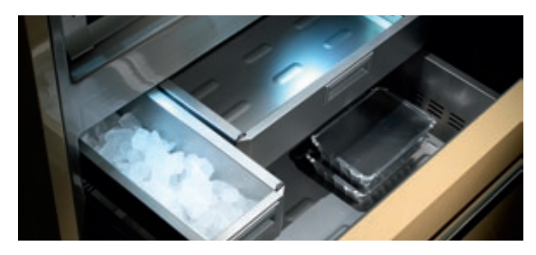
A built-in icemaker filters the water for greater purity, ensuring odourless and untainted custom-sized ice. The built-in water filter features a sensor that lets you know when to change it based on the amount of ice consumed.