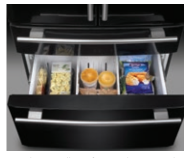
Two, large, pull-out freezer drawers make it easy to access each item. The freezer drawers feature five interchangeable compartments providing a net capacity of flexible 121 litres of storage.