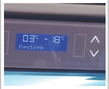
The treated anti-bacterial stainless steel interior and drawers captures cooler temperatures to reduce the effect of temperature changes.