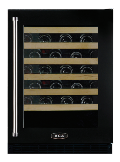
54-bottle Single Zone

The 44-bottle Dual-Zone Wine Storage Unit provides optimum storage temperatures for both red and white wine. The unit is divided into separate, precisely controlled temperature zones. The upper zone holds 24 bottles and the lower zone 20, with each featuring completely independent temperature controls. The temperature in either can be set to between 4.4°C and 18.3°C, allowing white wine to be chilled while ensuring red wine is perfectly presented at a warmer temperature. An optimum cellar temperature can be set for the entire unit.