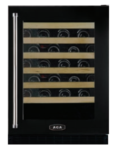
54-bottle Single Zone

The 44-bottle Dual Zone wine storage unit provides optimum storage temperatures for both red and white wine. The unit is divided into separate, precisely controlled temperature zones. The upper zone holds 24 bottles and the lower zone 20, with each featuring completely independent temperature controls. The temperature in either can be set to between 4.4°C and 18.3°C, allowing white wine to be chilled while ensuring red wine is perfectly presented at a warmer temperature. An optimum cellar temperature can be set for the entire unit.