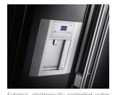
External, electronically controlled water dispenser providing fresh, chilled filtered water. It has a child lock functions and easy-to-change filter.

Note: *Cream side exterior panels **Black side exterior panels