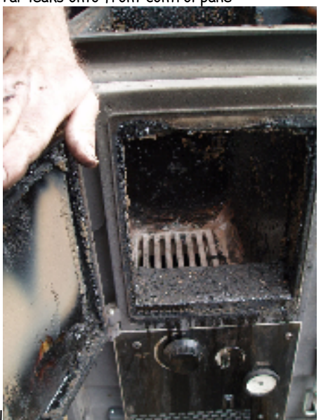
Tar on loading door glass